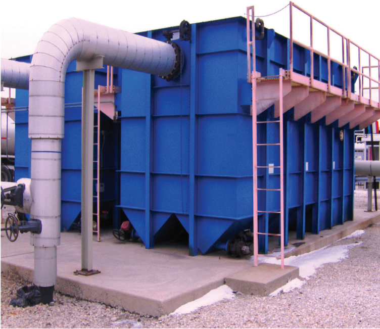
Influent enters through a headbox and is evenly distributed over the length of the cylinder