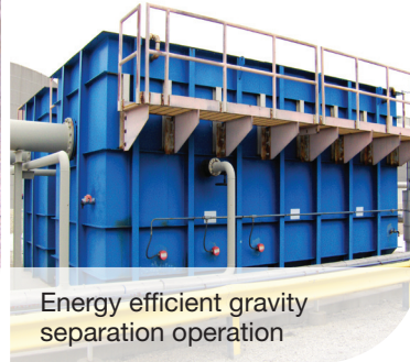
Energy efficient gravity separation operation